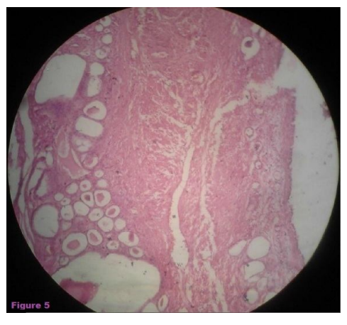
Figure 5. Histopathological section of cyst wall. From area A on cut section

Section from area (A) shows – cyst were lined with a single layer of cuboidal epithelium with hyperplastic epithelial cells were seen focally. Section from area (B) shows - tumor tissue composed of cells with moderate anisonucleosis, hyperchromatism and inconspicuous nucleoli, arranged in a papillary-trabecular, papillary solid pattern with fibro vascular core. Section from area (C) shows hemorrhage and necrosis. [Refer Fig.5 and 6] Impression: Papillary renal cell carcinoma (type 2) with polycystic kidney.