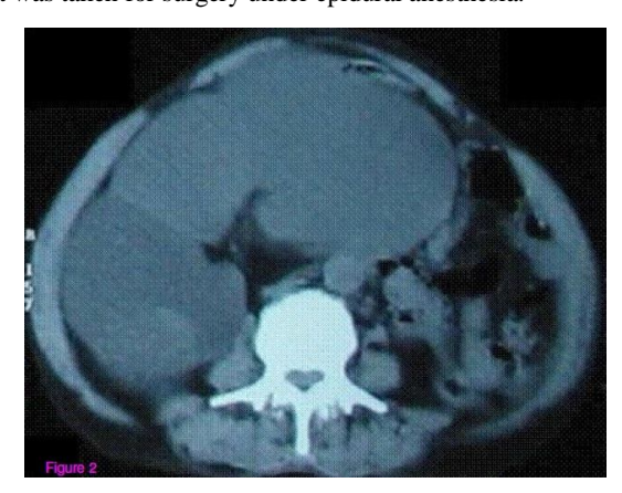
Figure 2. Abdominal CT Scan shows cystic renal mass crossing midline

Haemogram was normal, except Hb = 6.4 g % Blood glucose level, renal and liver function test were within normal limits USG abdomen showed right sided cystic disease of the kidney. CT scan of abdomen revealed huge, predominantly cystic, well defined mass occupying Right hypochondriac, lumbar, iliac, umbilical regions (having solid enhancing component, fat and calcified component, mass was seen separately from liver, Right adrenal gland with no obvious invasion or encasement of adjacent organs or vessels. No obvious lymphadenopathy or metastatic foci, Left kidney normal). Impression: Right renal polycystic mass or possibility of retroperitoneal teratoma with absent right kidney should be considered. [Refer Fig. 2] IVP: Grossly enlarged right polycystic kidney with multiple calculiincidental finding. CT guided FNAC showed moderately differentiated renal cell carcinoma. Preoperatively chest physiotherapy and 3 units of blood transfusion was given and then patient was taken for surgery under epidural anesthesia.