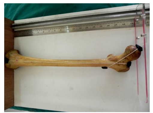
Figure 1. (Method of axis determination)

The bones were cleaned and observed under day light. The femur was fixed over the osteometric board .Midpoint of neck is determined by measuring the width of the narrowest part of the neck using vernier calipers and dividing it by 2. The point is marked with a marker on the surface of the bone. The axis is defined by means of a thread fixed on either ends of the bone along the neck axis. The diaphyseal axis is defined by another thread mounted through the center of the shaft of bone. The angle at the meeting point of the two threads is determined using a transparent protractor and the value is recorded. This angle between the neck axis and diaphyseal axis defines the neck-shaft angle of the femur [1].