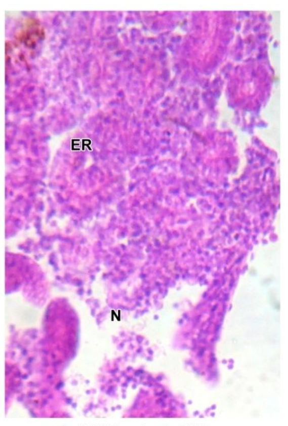
Fig.4. 30 days treated kidney N - Necrois ER - Enlargement of renal tubule

Fig.3. 20 days treated kidney N - Necrois SG - Shrinkage of glomeruli