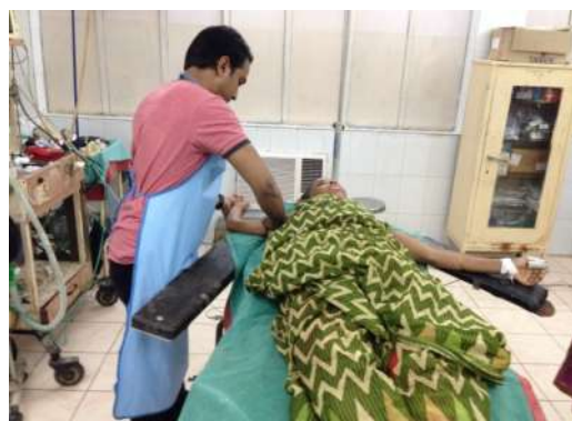
Fig 4A, 4B. Manipulation under Anaesthesia