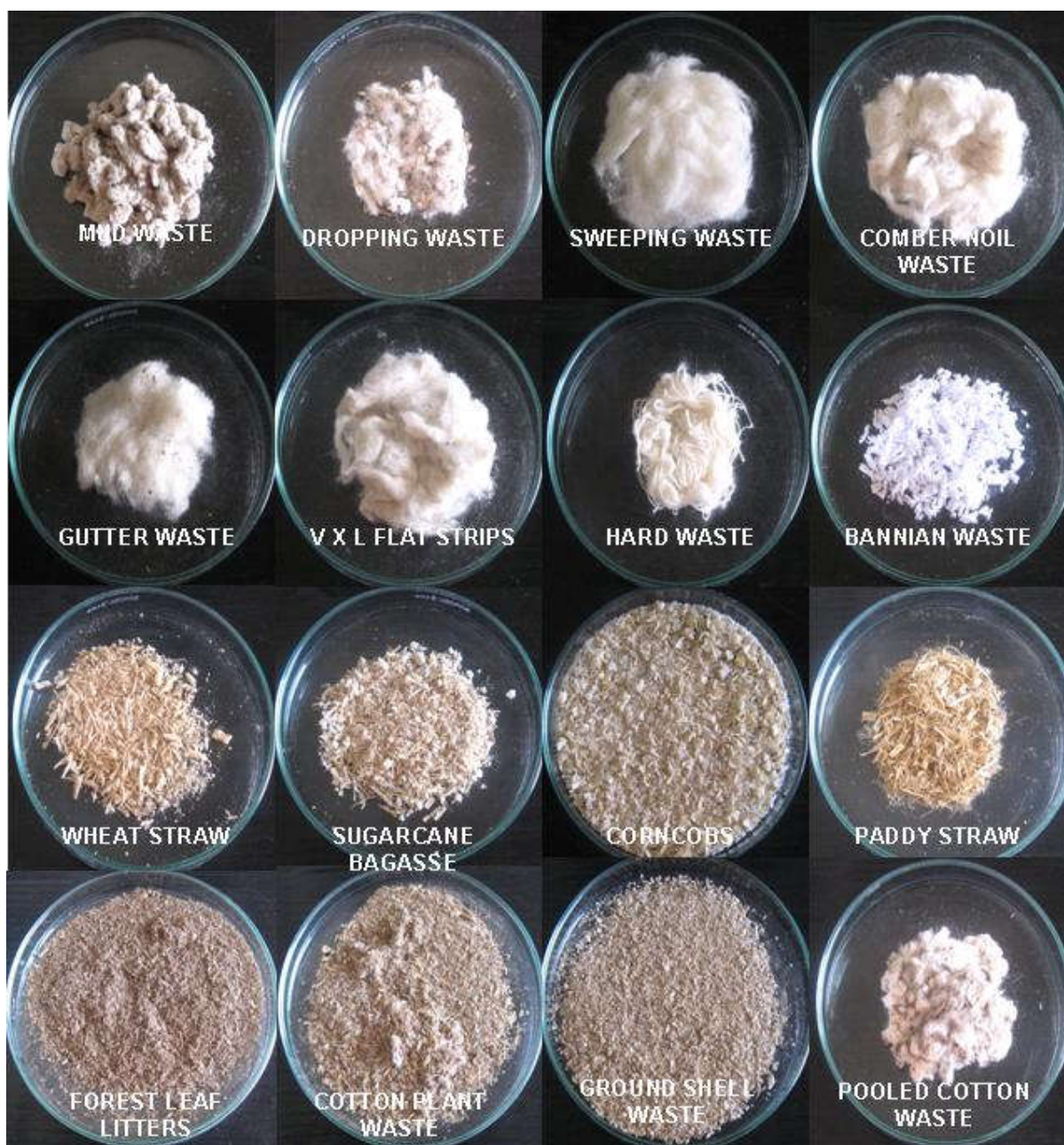
Figure 1. Agrowaste used in the present study