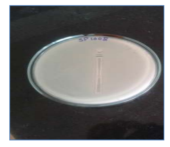
Fig 2. Disc diffusion assay for estimation of MIC by Vancomycin Ezy MIC strip showing no zone of inhibition up to 256 µg/ml

VSSA (MIC \leq 2\mu g/ml), VISA (MIC 4 to 8\mu g/ml), VRSA (MIC \geq 16\mu g/ml). (BSAC, 2011), (EUCAST, 2011)