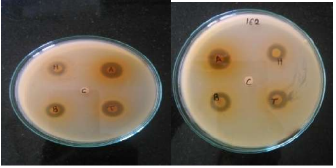
a. MRSA 296

Note: No Zone of inhibition was observed with DMSO as a control.