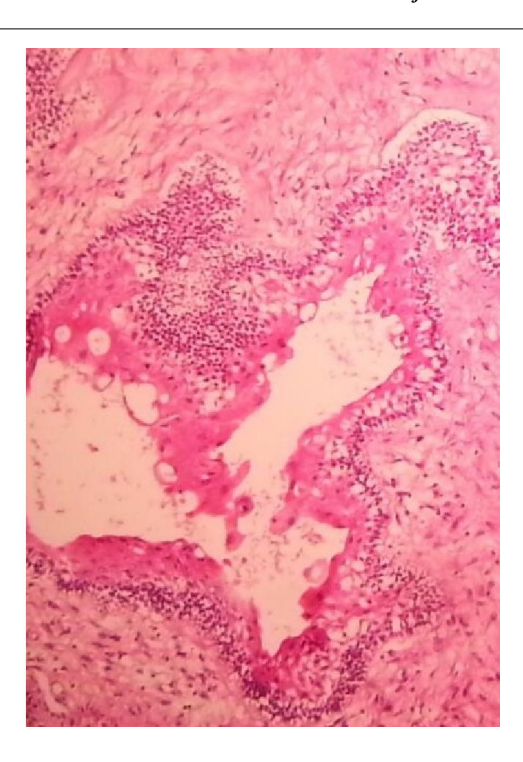
Fig. 5. Higher magnification demonstrating Vickers Gorlin criteria with ameloblastic lining composed of columnar basal cells in palisading pattern with vacuolated cytoplasm and hyperchromatic nuclei polarized away from the basement membrane was evident