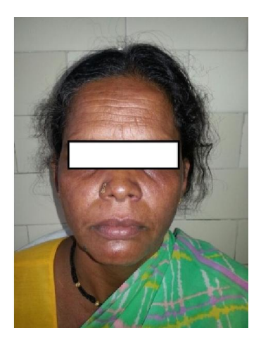
Fig. 1. Clinical photograh demonstrating diffuse swelling on the right side of the mandible

in size for 6 months. The patient reported no significant history of trauma. The patient's personnel, family and medical history were non contributory. Extra oral examination revealed the swelling measuring about 2cm x 4cm in size on right mandible extending anterioposteriorly to about 5 cm from the symphysis region and 1cm below the lower border of the mandible. The swelling is firm in consistency and tender on palpation. Bilateral cervical lymph nodes were non palpable (Figure 1).