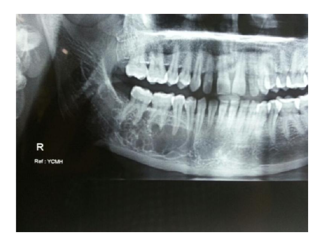
Fig. 2. OPG demonstrating a well delineated multilocular radiolucency extending from the distal aspect of 33 - 37 region

Intra oral examination at that time revealed the swelling extending from the mesial surface of right second premolar region to distal surface of second molar, obliterating the lingual vestibule. The regional teeth 35, 36 and 37 were non tender and not mobile (Figure 2).