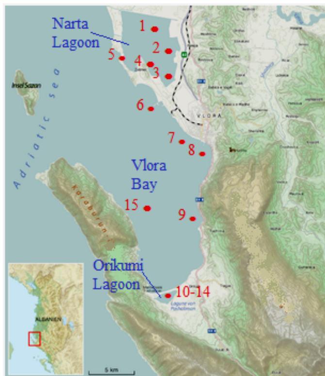
Figure 1. Network of sampling sites in Narta and Orikumi Lagoon and Vlora Bay

Vlora Bay is a half-closed bay with a reduced water exchange with the Adriatic Sea throughout the mezo-channel inlet. It is positioned in the south part of Albania and faces to Karaburuni peninsula and Sazani Island. Narta Lagoon , with geographical coordinates: 40° 32' N latitude, 19° 28' E longitude (Lami, 2002), is located in the northwestern part of Vlora Bay. It is one of the biggest lagoons in Albania. Orikumi Lagoon is located in the southwestern part of Vlora Bay with geographical coordinates 40° 19' N latitude; 19° 25' E longitude (Phare, 2002). Figure 1 shows the map of the studied area and the positions of the sampling sites.