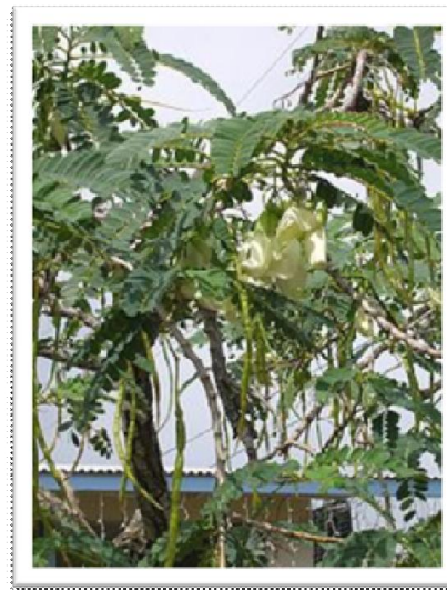
Table 1. Biochemical composition of Sesbania grandiflora (L.) Pers leaves (mg/100g)