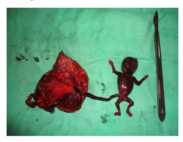
Figure 6. Showing of the mass content after opening