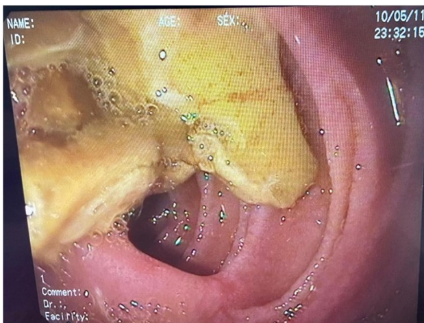
Figure 3. Endoscopy Showing Retained Inspissated Debris in Duodenal Diverticulum