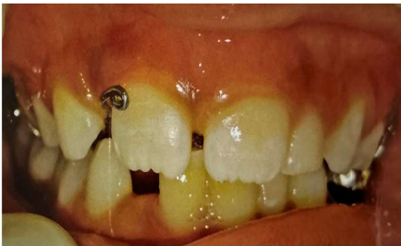
Figure 1. Pre operative

Phase 1: banding was done irt 16 and 26 followed by a novel design to fulfil the two objectives in a single plate fabrication. Banding was also done irt 75 for conventional band and loop space maintainer fabrication. A fixed appliance was preferred for patient compliance. Therefore, Nance palatal arch with finger spring incorporated within the nance acrylic button for mesial movement of 11(Figure 1& 2).