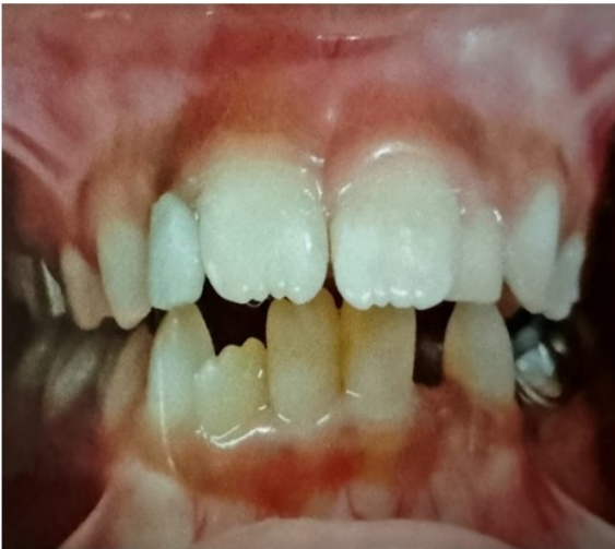
Figure 5. Phase 2 treatment: nance palatal arch