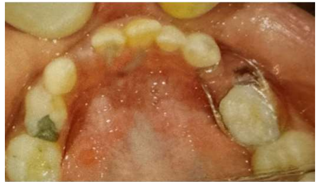
Figure 4. band and loop space material for 52 maintainer

Phase 2: Once the closure of diastema and desired space was achieved, the same finger spring was bent to use as an anchorage to incorporate functional space maintainer. maxillary impression was made, wax model of adequate measurements was done on the cast referring to the contralateral lateral incisors and reimpression of the cast was taken. Luxatemp material was used as a choice of material for the fabrication of lateral incisor replacing the space acquired by wax model (Figure 3). The appliance fabricated placed intraorally to check for the fit and occlusal harmony (figure 5& 6) and corresponding radiograph was taken (figure7).