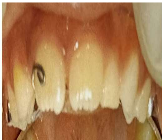
Figure 2. Intraoral image of the appliance

Finger spring was activated 2 mm once in month for 2 months until space regained. Conventional band and loop space maintainer cemented irt 75 (figure 4).