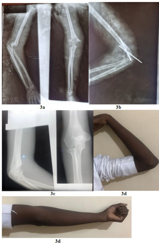
Figure 3. A 16 year old male with a displaced supracondylar fracture of the left humerus (3a), had crossed k-wire fixation and presented at 6 weeks postoperatively (3b). He later presented with a united fracture (3c) 2 years post-fixation showing satisfactory elbow function (3d).

With the fracture healing already setting in before the presentation, the closed reduction becomes nearly impossible to achieve, especially without risking the surrounding structures' integrity. More so, complications that may be associated with fracture at an early stage were presented late adding further challenges in managing both the fracture and the associated complications. Gartland type 1 fracture was excluded in the study because all our patients had displaced fractures either Gartland type 2 or 3 that required K-wire fixation. The justification for crossed K wire fixation in these patients has been reported by many studies as the best form of treatment particularly for stability (21). The recent publication by Zhu D et al, reported the outcome of conservative versus surgical treatment of Gartland type 2 supracondylar humeral fractures in children, even though they found no statistical differences between the two groups in fracture healing time and Flynn score, the conservative treatment was discovered to be superior to surgical treatment in functional recovery times (22).