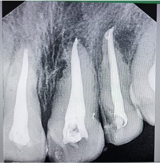
Figure 9. Three months after replantation (Calcium hydroxide as intracanal medicament)