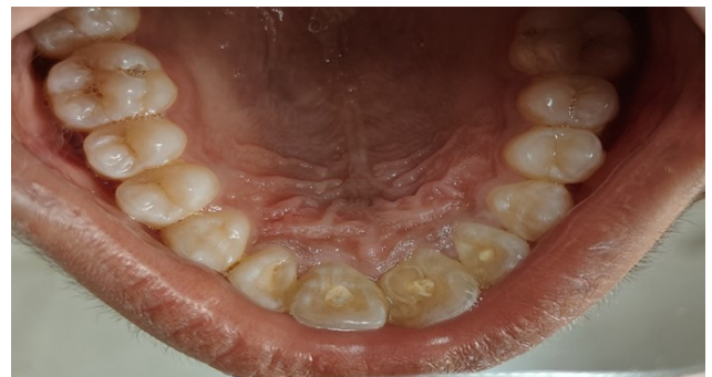
Figure 12. Palatal view