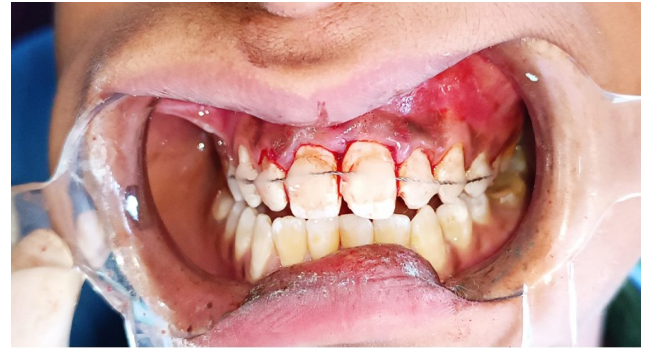
Figure 5. Splinting of avulsed teeth