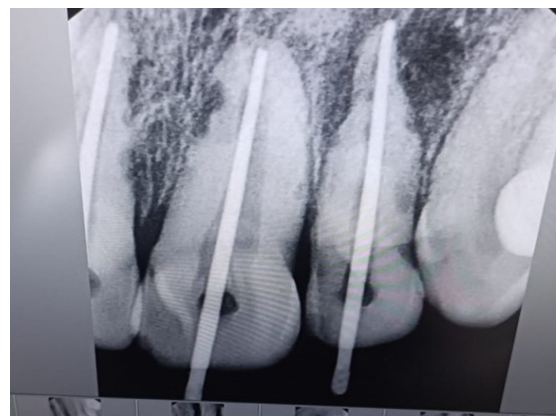
Figure 8. Two-months after replantation