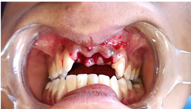
Figure 3. Pre-op picture showing avulsed maxillary central incisors and left lateral incisors