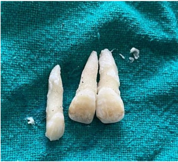
Figure 1. Avulsed teeth