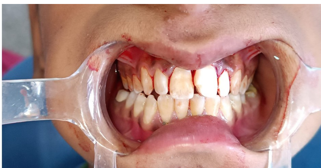
Figure 4. Positioning of avulsed teeth in the socket before splinting