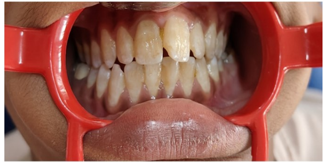
Figure 11. One year after trauma