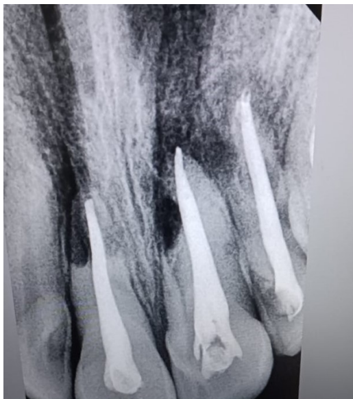
Figure 10. Six months after replantation

The roots and the sockets were cleaned gently with saline and the teeth were replanted into the socket with slight manual pressure. Once the teeth were seated, alignment was checked and stabilized with adjacent teeth using a semi-rigid splint by acid-etch composite resin technique. The position of the teeth was verified both clinically and radiographically. The splint was left in place for 4 weeks. Systemic antibiotics along with anti-inflammatories were prescribed.