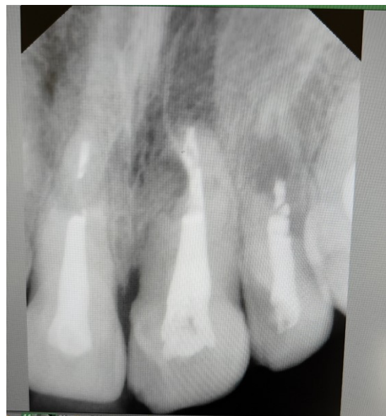
Figure 13. Periapical radiograph, 12 months after replantation