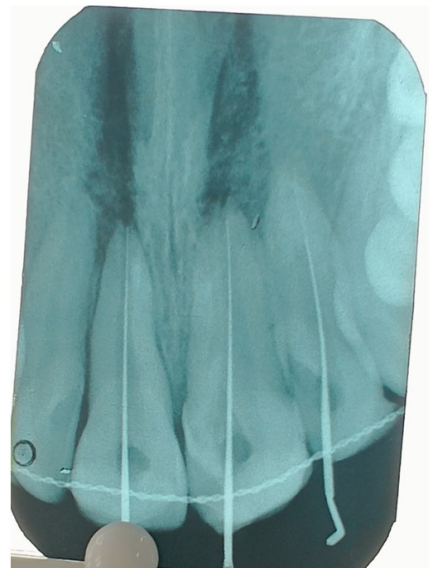
Figure 7. Working Length X ray (1 st week after splinting)