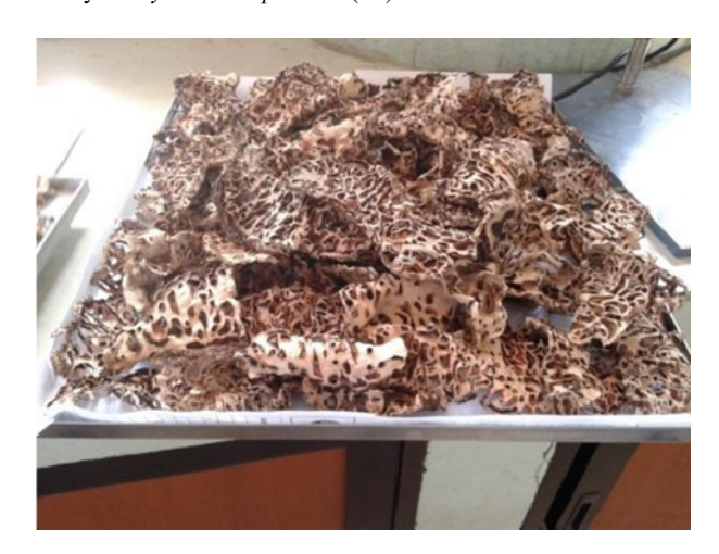
Figure 1. Myrmecodiapendans

Materials: Myrmecodiapendans also known as Sarang Semut plant (Figure 1)were derived from Wamena, Papua, Indonesia (11).WiDr cancer cells are obtained from Department of Medical Chemistry, Faculty of Medicine, University of Indonesia. Table 1 shows the taxonomy of Myrmecodiapendans (12).