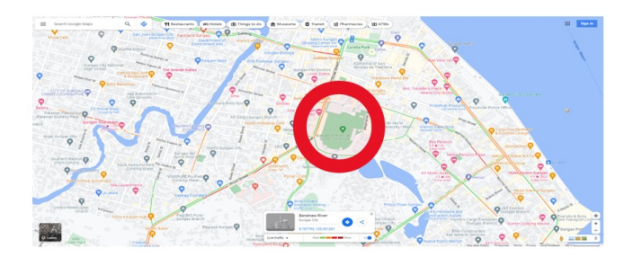
Map of Surigao Del Norte State University

Conceptual Framework: This study assesses users' utilization of library facilities, library services, library collection, and staff.