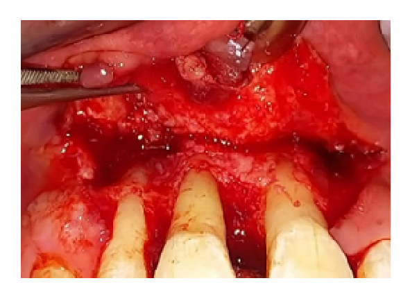
Fig 3. Full thickness flap elevated