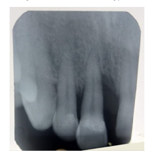
Fig 1. Pre-operative radiograph

mesiolabial aspect of 11, suggestive of repair/regeneration. The patient is kept under maintenance therapy.