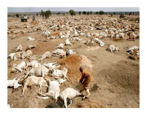
Plate 1: Drought-stricken cattle outside a slaughterhouse south of Nairobi, Kenya during the 2009 severe drought

percent of agricultural GDP. In the ASALs of Kenya, pastoral economy accounts for 90 percent of employment opportunities and 95 percent of family incomes and livelihood security (Huho et al., 2009; USAID, 2010). In northern Kenya, pastoralism is largely practiced by the Turkanas (2.56% of the Kenya population), the Maasais (2.18%), the Rendiles (0.16%), the Samburu (0.61%), the Gabra (0.23%), the Borana (0.42%), the Orma (0.17%) and the Kalenjins (12.87%). Pastoralism in this region is nomadic in nature, where herders adapt to spatial-temporal variability in pasture and water availability through herd migration. Drought is by far the greatest cause of livestock mortality (Plate 1). About US dollar 2 billion worth of livestock is lost annually to mortality, poor quarantines, diseases and missed trade opportunities, resulting in increased food insecurity in the drought-prone ASALs (USAID, 2010).