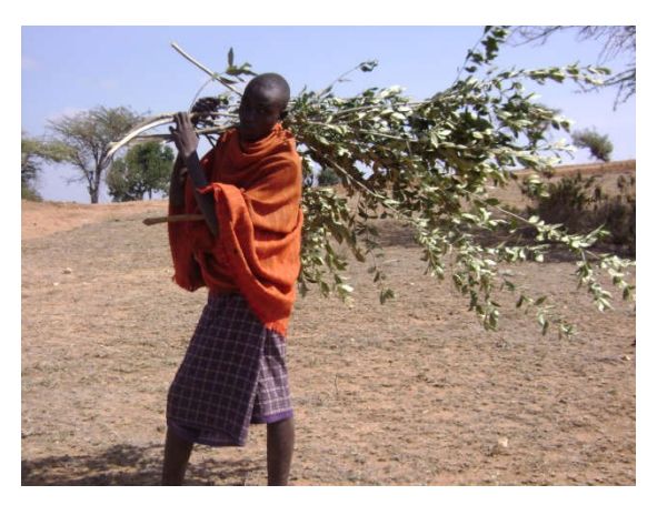
Plate 3. A Maasai pastoralist carrying some palatable twigs from Olea Africana

the beasts one-by-one for as little as Kenya shillings 1,000 shillings to buy feed for the rest of their starving herds and family consumption.