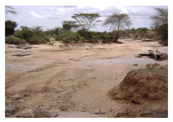
Plate 2. Dry Twala stream bed during the 2009 severe drought

For livelihoods that relied solely or partly on livestock in Mukogodo Division and other ASAL districts of the northern Kenya, the poor livestock body conditions and high livestock mortality rates caused by droughts had devastating effects on livestock prices. Income earned from livestock sales declined during droughts (Table 2) rendering the pastoralists to be among the poorest and the most vulnerable population in Kenya. Bevege (2009) observes that during the 2009 drought the Maasai pastoralists who once sold their cattle for as much as Kenya shillings 30,000 per cow off-loaded