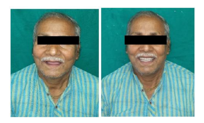
Fig 7: Preoperative and post opertative profile at smile.

Among the remaining teeth 34 and 45 had occlusal wear and teeth no 38 had grade 3 mobility. OPG revealed that patient had good periodontal support in 34 and 45 teeth (Fig 1).