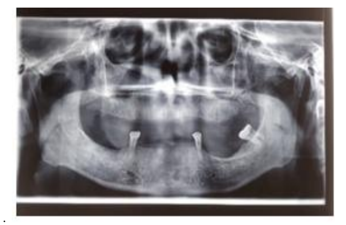
Fig 1. Preoperative patient OPG