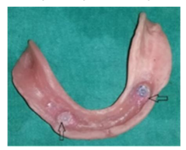
Fig. 6. O ring placed in denture tissue surface.