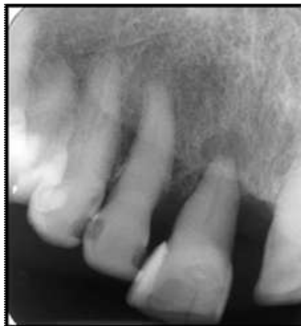
Fig 2. Tooth 11 presented with extensive periodontal probing and mobility. The tooth was planned for extraction because of poor periodontal prognosis, despite the probability of a favourable endodontic prognosis (Marshall, 1979).

The selection of cases for endodontic therapy should take into consideration the prognosis of the endodontic, restorative and periodontal procedures (Friedman, 2004). The flow chart (Fig 1) provides a diagrammatic outline of the decision-making process for treatment planning in endodontics. Once appropriate diagnostic tests have confirmed the pulpal and periradicular diagnosis, immediate treatment of the tooth may be required if relief of painful symptoms is needed. For a patient in pain, the dominating concern by the dentist is whether endodontic treatment will rapidly and predictably eliminate the patient's pain and discomfort (Montgomery, 1986). Following stabilization of the tooth, the dentist should exercise caution in deciding whether the tooth concerned has a good or poor prognosis.