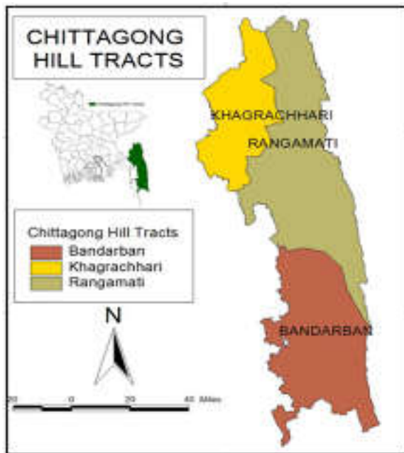
Figure 1. Map of Chittagong Hill Tracts

were trained thoroughly on the objectives of the study, as the participants of those villages were not fluent in Bengali and had their distinctive languages. Thereupon, language barriers were avoided.