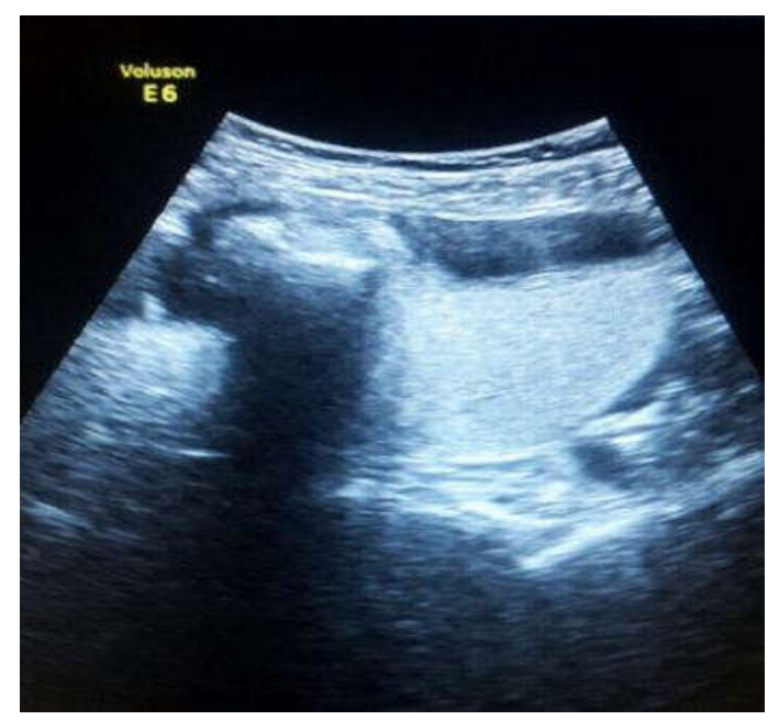
Figure 2. Acoustic shadow in an ovarian mass, suggesting dermoid, benign score IOTA 8.64