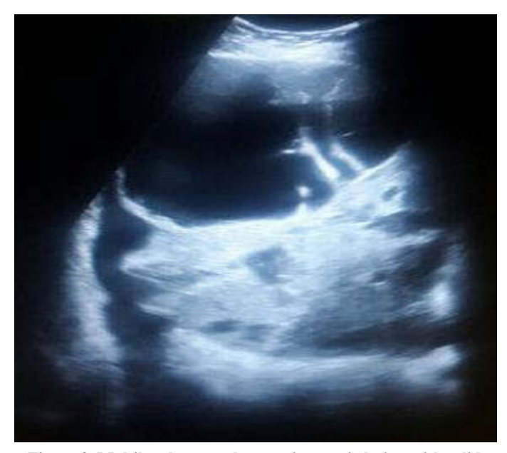
Figure 3. Multilocular complex ovarian cystic lesion with solid component, malignant IOTA score 76.1 indicating malignancy

In analysis of the CA 125 marker, the mean CA 125 marker seen in the malignancy was 69.6 u/ml, while the mean CA 125 marker seen in the benign was 30.6 u/ml. The IOTA score was calculated and analyzed, and shows that IOTA score was efficient in defferentiation of benign from malignant ovarian tumors, The IOTA score in histopathologically proved malignant cases was 78.7 while in benign cases, it was 8.2 with a p value was 0.0001 which was statistically significant. There were 38 cases with benign according to histopathology (37 of them was benign according to the IOTA score and 1 was malignant), and there was 13 patients with malignant according to histopathology (12 of them was malignant according to IOTA score and 1 was benign). The sensitivity of the IOTA score system was 92% and specificity of the IOTA was 98% in detection of malignancy. The most common benign tumor was dermoid (9 cases (23% of the benign cases)), while the most common malignant tumor was mucinous cystadenocarcinoma (4 cases (30% of the malignant patients), the other histopathology seen in the study groups were listed in the Table 3.