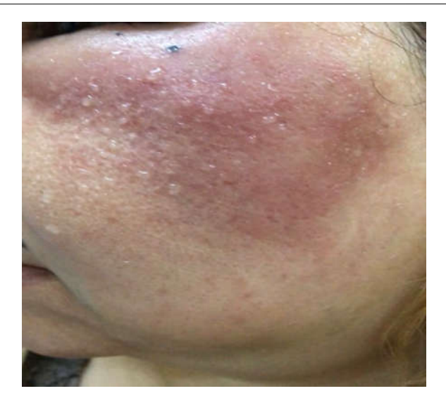
Figure 1. Preoperative picture