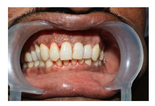
Figure 4:1 year Post Op View