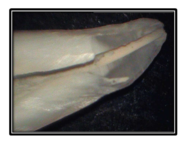
Figure 1. Group 1 (M Two R Files)

retreatment files in respective groups was performed using X-smart endodontic motor. After the Guttapercha removal, all the teeth were sectioned longitudinally and scanned under stereo microscope (Figure 1-3).