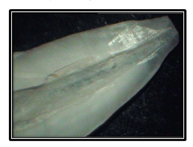
Figure 2. Group 2 (Protaper D Files)