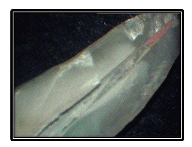
Figure 3. Group 3 (R Endo Files)