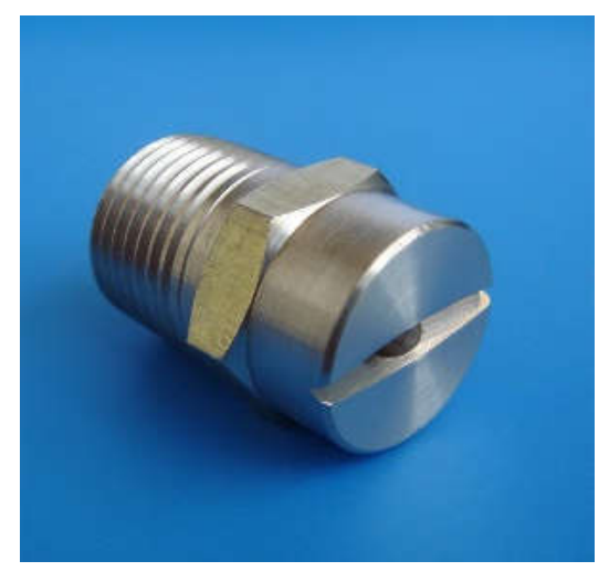
Figure 3. Flat Jet Spray Nozzle

Flat Jet Spray Nozzle: Flat jet spray nozzles are designed for high pressure washing application. Their specially designed inner profile allows for even jet distribution, which results in effective and uniform cleaning action over the surface being processed (John Durkee, 2009). It is ideal for Degreasing and Rinsing in industrial washing machine. Jet spray nozzle is shown in Figure 3.