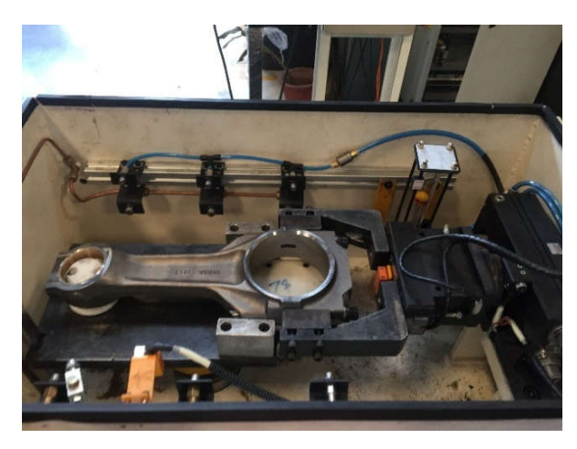
Figure 1. Washing and Cleaning Unit