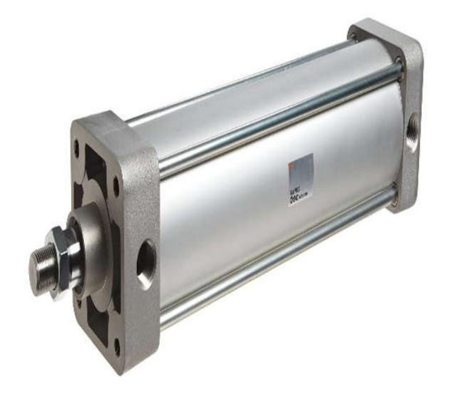
Figure 2. Pneumatic Cylinder

Pneumatic cylinder: It is primarily used to control the movement of door and provides reciprocating motion to the rest pad in desired time interval (Jun Lia et al. , 2013). Schematic diagram of pneumatic cylinder shown in Figure 2.