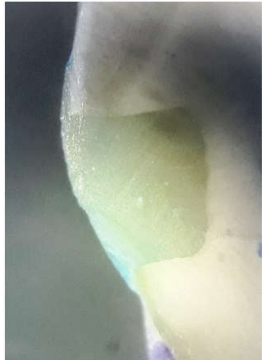
Figure 1. a Digital photograph of a specimen shows no dye penetration at restoration-enamel and restoration –dentin junction “Score –0”

Samples were then subjected to 200 thermocycles between temperature baths at 5 0 C and 55 0 C. Cycle in each bath lasted for 30 seconds with 10 seconds transfer time. With the help of composite resin, the root apices were sealed. The teeth were then painted with two coats of nail varnish to leaving 1mm of the margins around the restorations. The samples were immersed in methylene blue dye (Always, Wadi, Nagpur) for 24 hours at 37 0 C and then washed for one minute under running tap water and dried. The teeth were sectioned longitudinally through the center of the restorations with the help of Isomet diamond saw under water coolant. All sections were observed under a binocular stereomicroscope at 20X magnification. Representative stereomicroscopic photographs are shown in Figure 1, 2 and 3. The depth of dye penetration at tooth restoration interface was blindly scored by two independent precalibrated investigators. The samples were coded and mixed for blinding so that the investigators could not identify the group of samples. The microleakage score was recorded separately for both occlusal and cervical margins on a nonparametric ordinal scale from 0 to 3 (Alani and Toh, 1997).