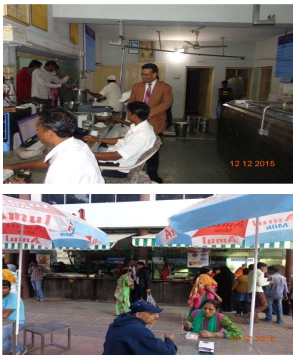
Fig. 2. When we will be like this?

As per adoption of Raha (2009) and others revealed the pasteurized liquid milk marketing share for branded milk marketing organization in Bangladesh like Milk Vita 52.08%; BRAC Dairy 20.83%; PRAN Dairy 10.42%; Amomilk 2.60%; Bikrampur Dairy 2.59%, Shelaidaha Dairy 2.58%; Aftab Dairy 2.08%; Rangpur Dairy 2.08%; Akiz Dairy 1.04%; Tulip Dairy 0.78% and Grammen /CLDDP 0.03%. The average growth rate of dairying in Bangladesh stands at 6.76% beyond demand growth rate about 10% due to increase of purchasing capacity and food habit change of consumers. In fact dairying in our context may therefore serve as a powerful instrument for the rural prosperity devising a viable dairy development strategy for the rural smallholder calls for detailed analysis of strengths, weaknesses, opportunities and threats posed by the external environment.