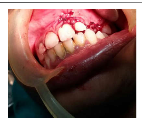
Fig.10. Suturing done

The surgical site was then sutured with the help of 3-0 mersilk sutures (Fig. 10). The patient was then followed up for the next 3 months for any surgical complications.