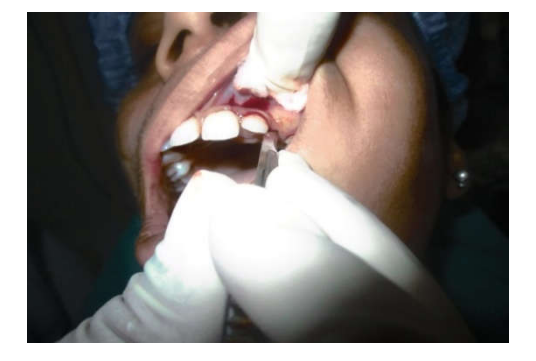
Fig.5. Incision given