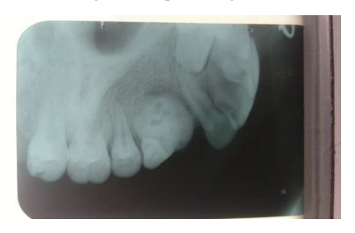
Fig.4. Occlusal View