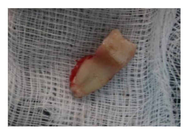
Case Picture 5. Distal segment of 47