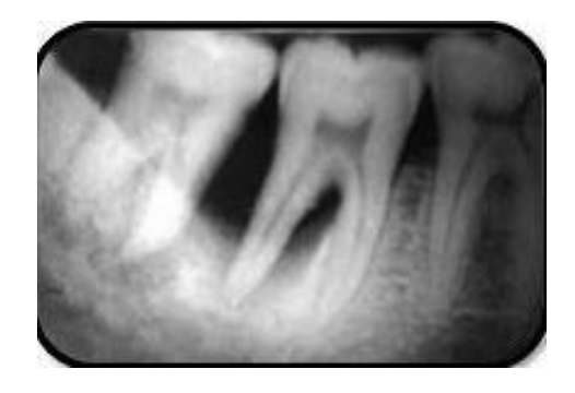
Case Picture 3. Radiographic View

Radiographic examination reveals radiolucency involving the distal root of 47. A root canal treatment was planned for the patient which was to be followed by hemisection. The defect was packed with OSSIFI© alloplast bone graft material, and PERIOCOL© membrane was used to cover the defect and sutured. After sufficient healing, the tooth was restored using a