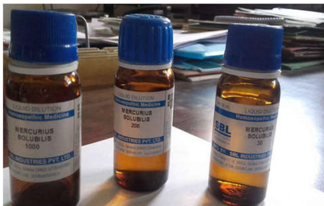
Fig. 1. Photograph of the Mercurius Solubilis 200 taken in the present investigations