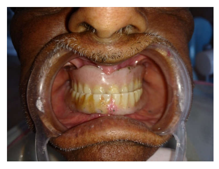
Figure 1. Pre-surgical intra-oral view with existing denture