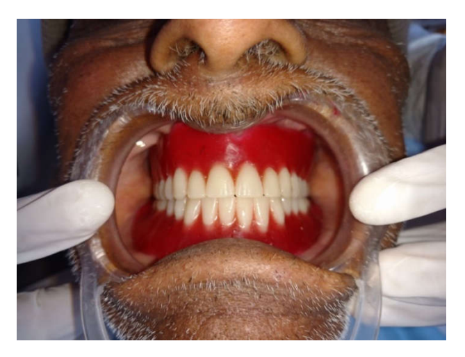
Figure 5. Try-in