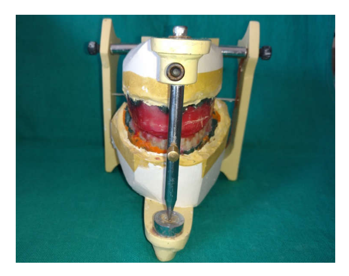
Figure 3. Mounting on the mean value articulator

The plane of occlusion on maxillary denture was established using base plate wax following esthetic, phonetic and anatomic guidelines. A layer of soft base plate wax was added on the mandibular denture, and OVD was established (Figure 2). The patient was trained to close in centric relation using bimanual palpation technique and the centric jaw relation was recorded using nick and notch method using Jetbite (Coltene/Whaledent) Polyvinyl siloxane occlusal registration material.