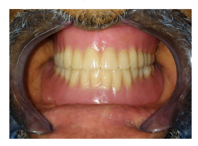
Figure 6. Post-surgical intra-oral view

Maxillary and mandibular final impressions were made with light body PVS material (Reprosil, Dentsply) using the closedmouth impression technique. With the dentures sealed in centric record, the master casts were fabricated by first pouring the maxillary denture base and subsequently mandibular denture base. The casts were mounted on the mean value articulator without separating them from the denture (Figure 3).Wax was added where nick and notch was done to reestablish the complete occlusal plane. The midline was marked on the maxillary and mandibular cast by extending it from the occlusal rim and then the overjet was measured to use