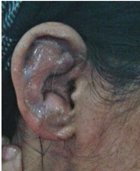
Fig. 1 left ear, fig.2 right ear loss of architecture of left ear with sparing of ear lobule and inflammation of right auricular cartilage