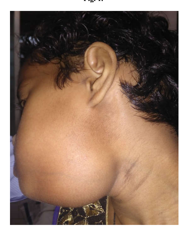
Fig.1. and Fig. 2. Cystic swelling of left submandibular gland