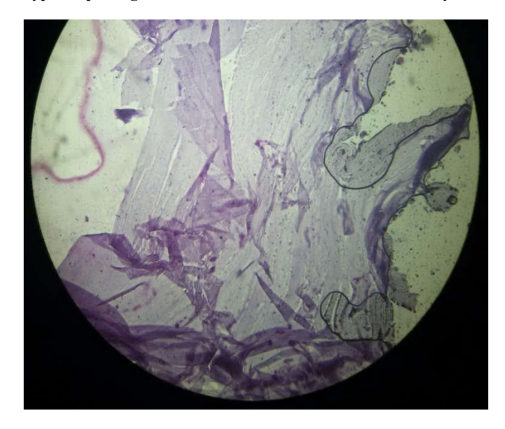
Fig. 5. Histologic section of Hydatid cyst showing bands of eosinophillic laminated membrane