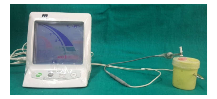
Photograph 3. Electronic measurement of the prepared sample

This shows that the phenomenon associated with the electronic measurement of the root canal is a physical process and has nothing to do with biological characteristics (Huang,. 1987). From the statistical analysis it was seen that difference between actual length and electronic length was highly significant in group I (NaOCl) while in other two groups it was not statistically significant. Also the difference between group I and group II, group I and group III was statistically significant. These results showed that when sodium hypochlorite was used as an irrigant in the canals, readings shown by Root ZX II apex locator were shorter than the actual length. In case of Chlorhexidine and Glyde the difference was insignificant.