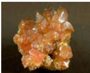
Comments: Deep orange-colored orpiment crystal aggregate. Location: Twin Creeks mine, 62 bench, north of Winnemucca, Humboldt County, Nevada, USA. Scale: 6.5 x 5.5 cm.