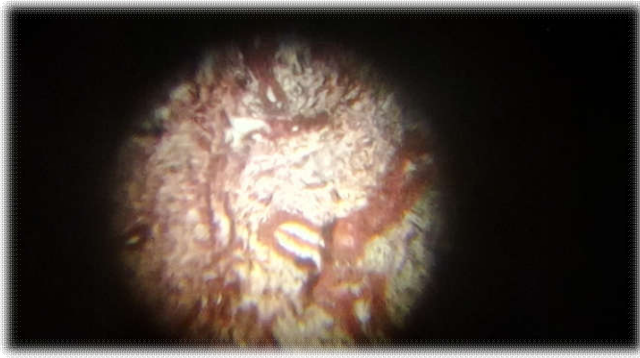
Figure 2. Brown elastic fibers in a yellow background