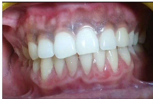
Figure 4. Complete healing of the lesion