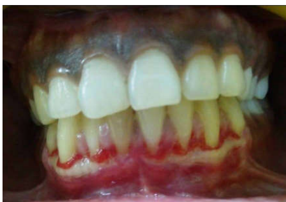
Figure 1. The underlying alveolar bone exposure in the buccal mandibular anterior region