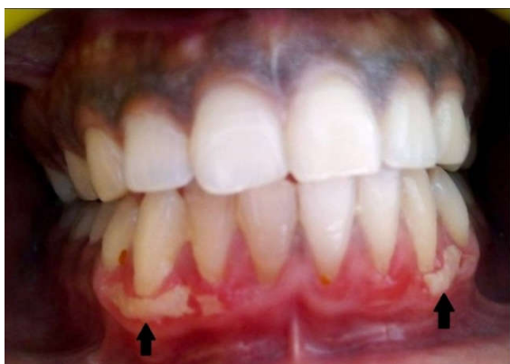
Figure 2. Lesion showed secondary healing eventually, and the formation of sequestrum (black arrows) which was later removed