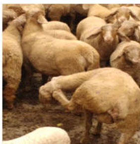
Scratching with the hind leg