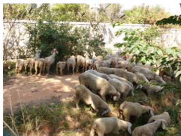
Grazing & Browsing