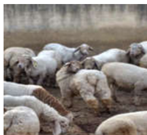
Muzzle to body touch