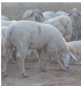
Fore limb licking