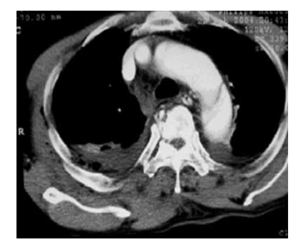
Figure 2. CT of the thorax evidencing filling failure in the posterior portion of the aortic arch and beginning of the descending. Bilateral hemothorax

easily on the edge of the bed or in the operating room before the operation.