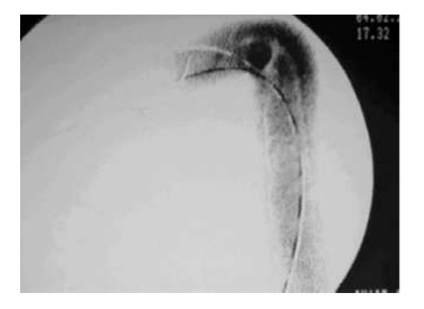
Figure 4. Aortography - Before endoprosthesis implantation. Note the graduated catheter and filling faults in the lumina of the aorta

Regarding surgical techniques, we can cite the open technique based on a left thoracotomy in cases of injury of the descending aorta or sternotomy in patients with injury of the ascending aorta for primary repair of the aorta or the replacement of the affected segment by a graft or graft (Harris, 2016). In the descending aorta lesions, should be made the establishment of diversion of blood flow through centrifugal pumps and cannulation of the left atrium and left common femoral artery, as well as systemic heparinization. This technique is preferable in patients with unfavorable anatomy (Harris, 2016). It's worth pointing out that many patients do not survive the initial event, consequently does not undergo a repair attempt. Endovascular thoracic aortic repair (TEVAR), refers to the minimally invasive approach, which involves placing a stent graft in thoracic aorta or ring, possessing ample indications. The technique involves inserting modular grafts through the dissection of iliac or femoral arteries to thoracic aorta excluding vessel damage (Harris, 2016).