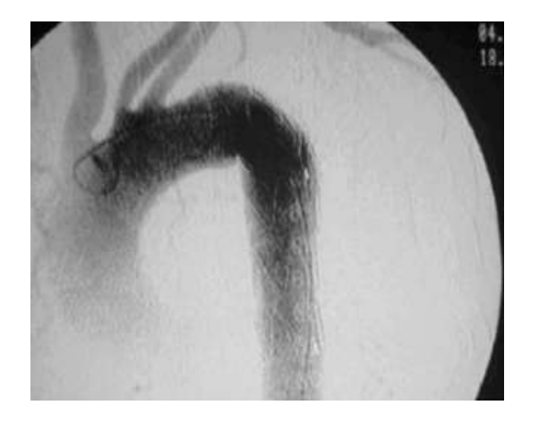
Figure 5. Aortography - After endoprosthesis implantation

In the case of femoral arteries, after dissection of the right femoral puncture of femoral artery left there for the introduction of catheter, where there is the diameter of the aorta and if intralaminar defects are excluded, when inserted into the stent. Is recommended in victims with favorable anatomy, and has a more comfortable postoperative period and brief (Harris, 2016). A series of studies, has suggested various subgroups of high-risk patients without complications, which can benefit from early TEVAR. The specific predictors of early or late adverse events have been identified in multiple studies, and include: an aortic diameter of 4.0cm home, with a