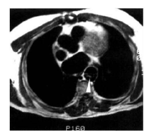
Figure 3. MRI: revealing descending thoracic aorta dissection; Intraluminal sign (arrow) in false lumen, representing a slow and turbulent blood flow

These advantages make this ideal for use in most patients with aortic dissections, including those relatively unstable. The examination can be carried out immediately after the patient to come to the Emergency Department. Their sensitivity ranges from 95% to 98% and specificity of 63% to 96% (Erbel, 1989 and Nathan, 2015). The most important discovery in the diagnosis of aortic dissection, which can be seen in this survey, is the presence of a border rippling intimal within the lumen of the aorta, which differentiates a false lumen light real (Ahmet, 2007). The arteriography was used for many years as the mode of choice to demonstrate the aortic dissection. Is an effective procedure to demonstrate the direct signals of dissection, the flap of the intimate and blood flow in the true and false lumens (Ahmet, 2007). Erbel et al. (Erbel, 1989), reported 88% sensitivity and specificity of 94% for this examination in the diagnosis of aortic dissection.