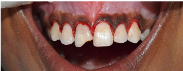
Figure 3. b) gingival tissue removed