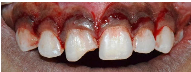
Figure 3. a) incision was made using a Kirkland knife