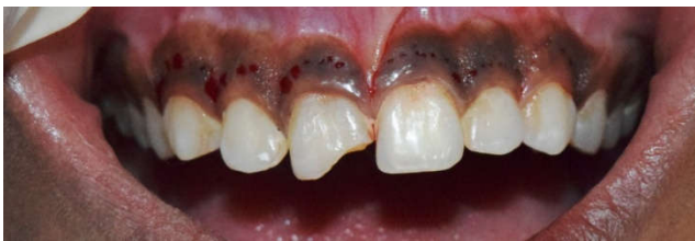
Figure 2. Pocket marking was done