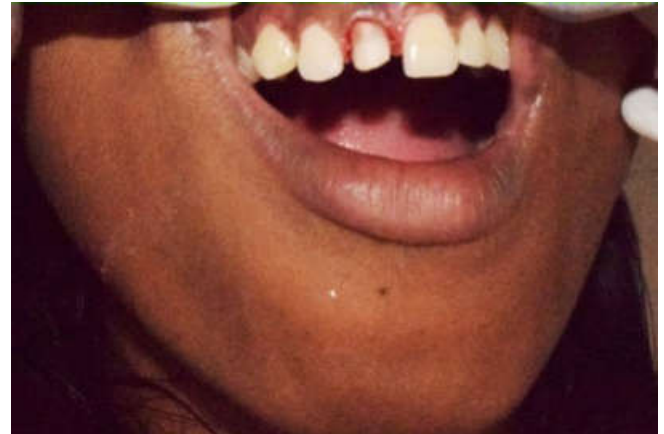
Figure 5. a) Crown preparation done