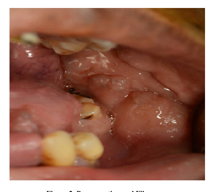
Figure \ 2. \ Pre-operative \ or al \ Fibromas