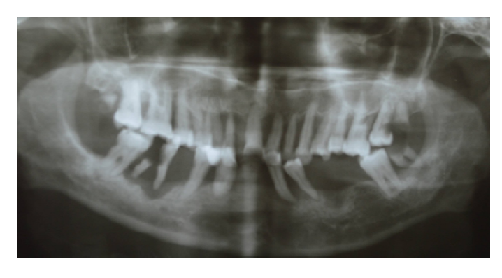
Figure 3. Pre-operative radiograph (OPG)