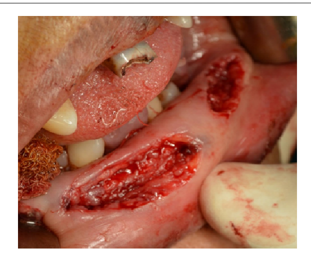
Figure 4. Surgical excision of Fibromas