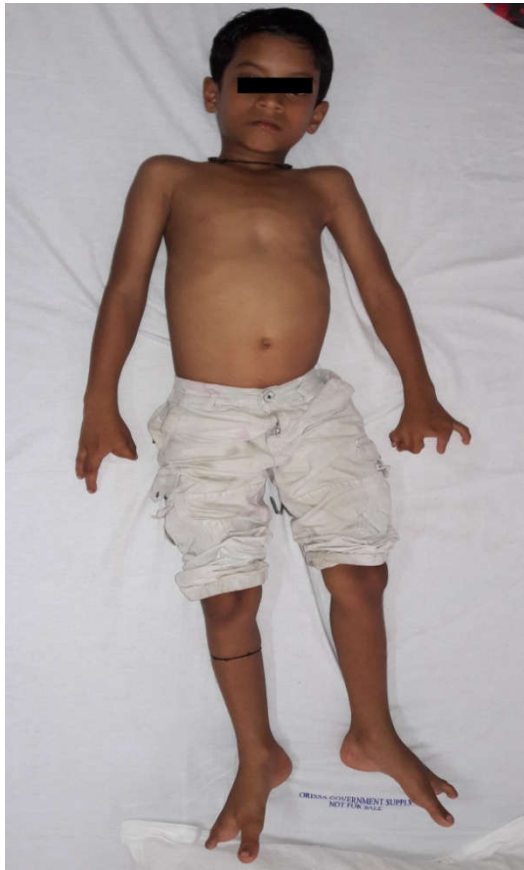
Figure 1. Ectrodactyly affecting both hands and feet