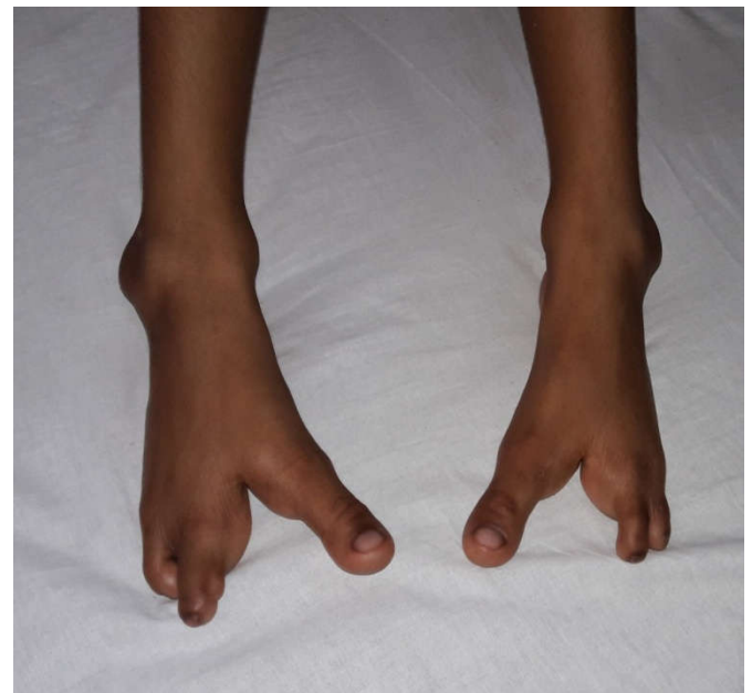
Figure 4. Aplasia of phalanges of toes in both the feet with classical cleft foot or split foot appearance