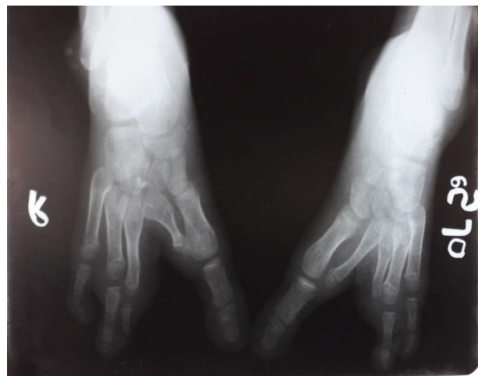
Figure 5. Aplasia of phalanges of toes (Right-2 nd , Left-2 nd & 3 rd ) depicted in X-ray