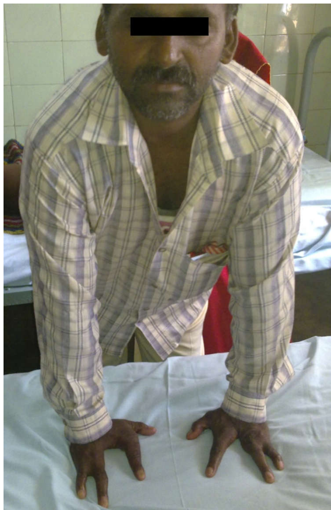
Figure 6. Both hands--Aplasia of phalanges of middle fingers