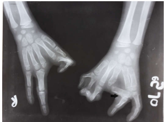
Figure 3. Arrow mark indicates transverse bone (Its growth will widen the cleft)