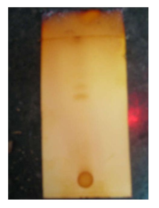
Figure 1. T.L.C. Plate in Day light