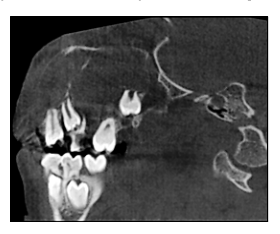
Fig. 4. CT-Sagittal view showing multiple impacted teeth

Base on the clinical findings. A benign odontogenic tumor was considered. The incisional biopsy was taken. Histopathological report was no conclusive and hence the treatment was decided for Enucleation and curettage. The patient was prepared for all investigations. Surgery was planned under general anaesthesia. Patient was scrubbed and draped in routine surgical manner, crevicular incision was taken with two releasing incision, mucoperiosteal flap was reflected and tumor mass was exposed. (Fig.5) There was a definite delineation between tumor mass and the mucosal layer; hence it shows encapsulation of tumor mass within the bone. (Fig6) The entire tumor mass was removed and curettage was done. (Fig7,8) The tumor mass was sent for histopathological examination. The macroscopic appearance of tumor mass was grayish-white, glistening, firm, mucoid surface with semigelatinous consistency. (Fig9) Histopathological findings of OM tumor was loose, abundant mucoid stroma which contains rounded, spindle-shaped cells. (Fig10) The tumor cells are evenly spaced within a fine fibrillar mucinous matrix. Fewer amounts of collagen fiber and inflammatory infiltration was rarely seen.