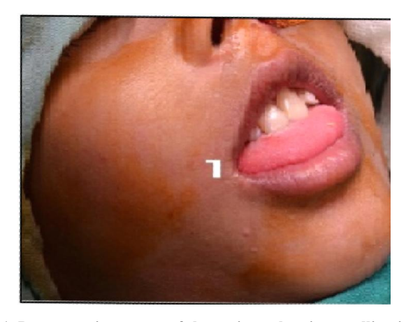
Fig. 1. Pre-operative aspect of the patient, showing swelling in the right infra-orbital region and extending posteriorly

A 13 year old male child was referred to our department of Oral and Maxillofacial Surgery. Govt. Dental College and Hospital Mumbai, with a history of slowly enlarging right maxillary swelling since one year. The patient denied bleeding, mucosal ulceration, or paraesthesia. Extra oral examination shows a diffused swelling in the right infraorbital region obliterating a nasolabial fold and extending posteriorly in the posterior maxillary region. (Fig1) Intra oral examination revealed swelling extending from right canine region to right maxillary tuberosity and the buccal vestibule was completely obliterated. There was no expansion at right palate. The mucosa overlying the area of the lesion was normal. The rest of clinical head and neck examination was unremarkable. No significant medical history was present. A panoramic radiograph was taken which showed radiolucent lesion in the right maxilla with interlaced bone trabeculae resulting in multilocular appearance with impacted canine.