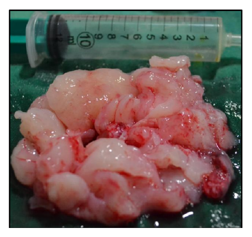
Fig. 9. Gross specimen showing a white gelatinous mass