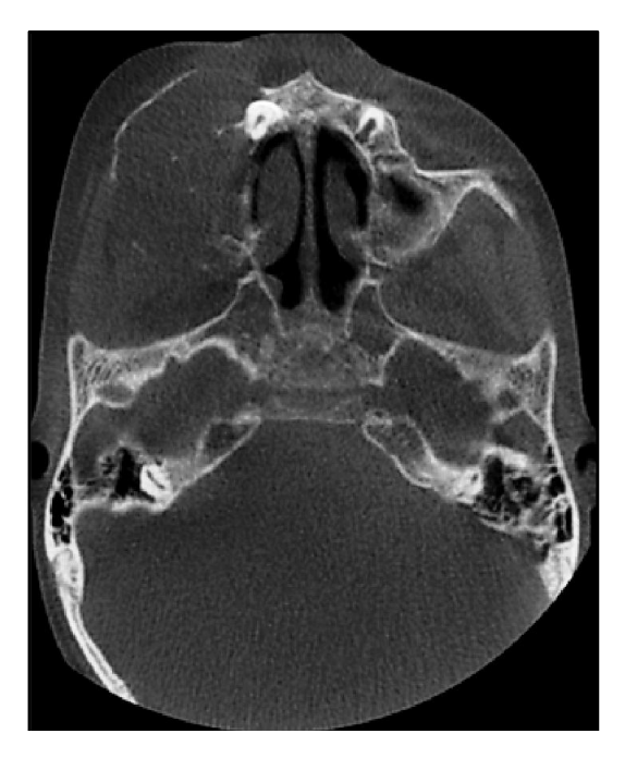
Fig. 3. CT-Axial view showing labial and buccal expansion

A computed tomography showed a large mass involving the right maxillary sinus with destruction of bony margin of the anterior and lateral right maxillary sinus wall. (Fig. 2,3,4).