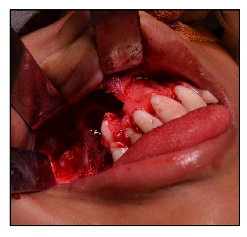
Fig. 7. Removal of the tumour