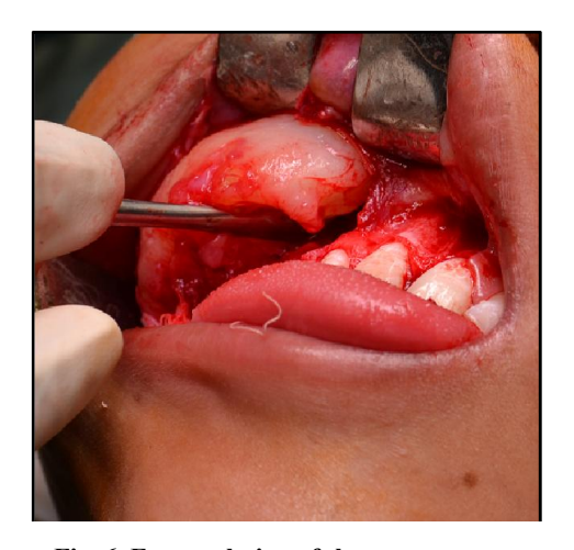
Fig. 6. Encapsulation of the tumour mass