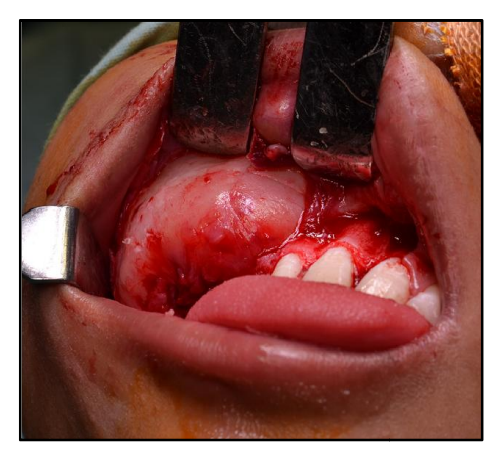
Fig. 5. Intra-operatively, surgical exposure of the tumour mass