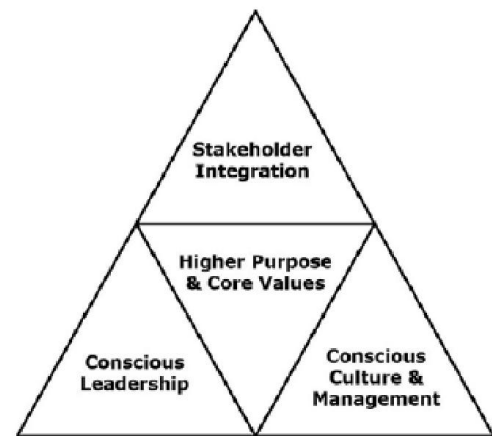
Figure 2. The four tenets of conscious capitalism

As Barclay (2015) suggests, the more awareness and self-mastery you (the leader) develop of your own values, the more consciousness you develop for appreciating and understanding the values of others (employees). The demand for such conscious leadership is arising and leaders are now expected to integrate values such as ethics, integrity and transparency, along with non-traditional business concepts such as co-creation, love, and wholeness in the management of profit, people and process. This is the exact type of amalgamation of leadership qualities that are needed to create a Great Place to Work, thereby ensuring a win-win situation on whole. In this era where companies are in more scrutiny than ever before, conscious and ethical leadership is important for conscious capitalism, thereby creating an overall positive impact on the society as a whole. Conscious leadership is an important element of this jigsaw (refer to the pictorial below) as is conscious culture and management.