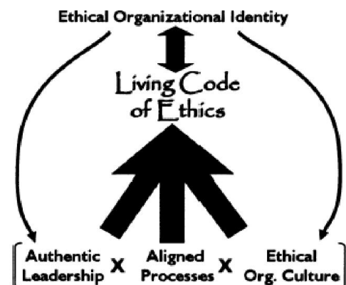
Figure 1. Model of the living code of ethics in a positive ethical organization

A great place to work therefore is one where employees trust the people they work for, have pride in what they do and enjoy the people they work with. To put things into perspective we need to see the role of an ethical leader in the organisation. A comprehensive model for ethical organization identity, a necessity in the current external climate, has been developed by Verbos et al. (2007). The model posits that ethical organizational identity emerges from the multiplicative interaction of authentic leadership, aligned organizational processes, and ethical organizational culture. Authentic leadership is a positive organisational scholarship theory of leadership anchored in positive values, beliefs and behaviours incorporating moral capacity. Within a positive ethical organization, ethical practices are (1) modelled and promoted by authentic leaders; (2) infused through a positive organizational context in which formal and informal organizational structures, processes and systems are aligned with ethical practices; and (3) sustained and reinforced in an ethical organizational culture in which heightened ethical awareness and salient ethical identities among members contribute to a strong positive climate regarding ethics.