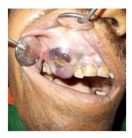
Fig. 3. Clinical photographshowing pigmented exophytic overgrowth