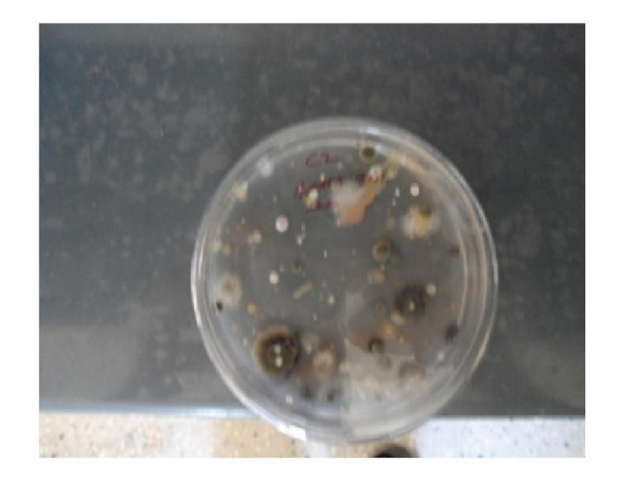
Fig.1. Air borne common fungal species in the petriplates from poultry farm site