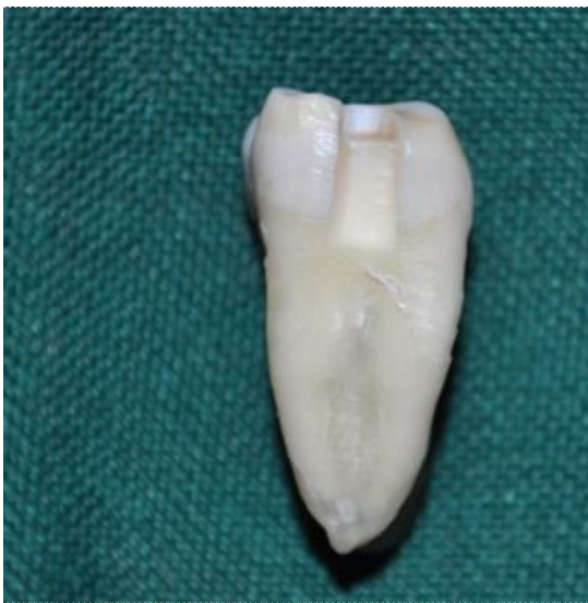
Fig. 1. Final specimen before composite placement