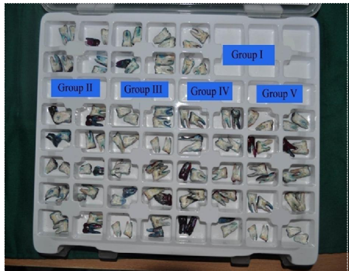
Fig. 2. Final prepared specimens in their respective groups