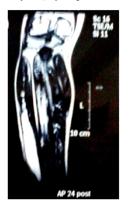
Figure 1. MRI showing well defined, oval shaped cystic lesion with tapering ends along the lateral aspect of right leg within the peroneus muscle

leading to distension of the bursa and herniation of the posterior part of capsule. (Meyerding and VanDemark, 1943)